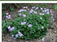
Wild Geranium Geranium maculatum