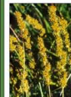
Fox Sedge Carex vulpinoidea