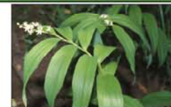
False Solomon's Seal Smilacina stellata