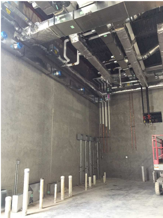
MEP rough in continue through the Jail area of the building with ductwork, plumbing piping getting installed and insulated and electrical conduits all ready for the cells