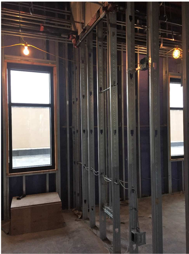
The final windows were installed on the upper roof since the brickwork install and washing was completed!