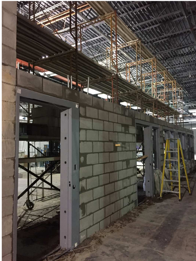
Masonry walls continue to be built up in the jail area along with the setting and installation of detention door frames!