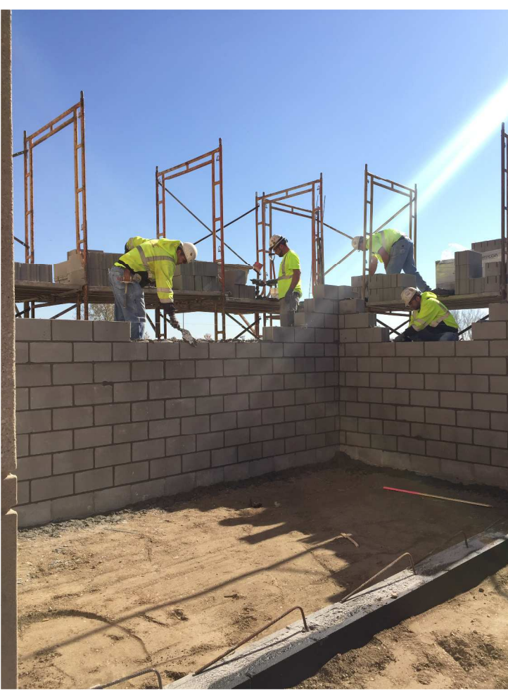
Masonry crews worked on above grade CMU walls of the trash enclosure with the nice weather at the end of the week!