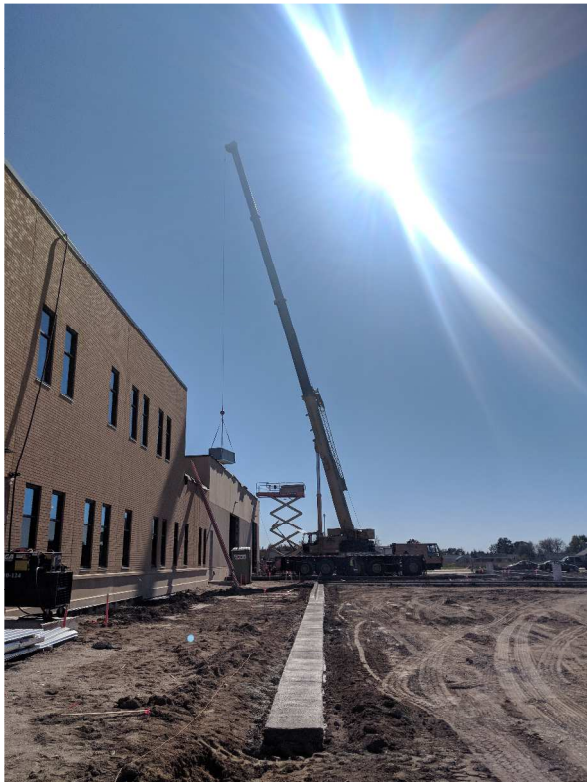
The last mechanical roof top unit was installed this week!