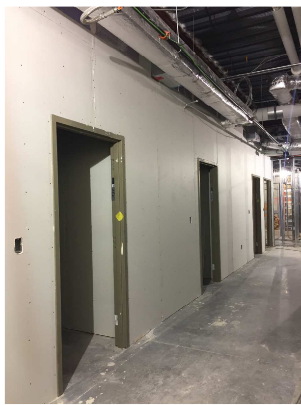
Sheetrock making great progress down in the lower level. 1st and 2nd floor frames continue install!