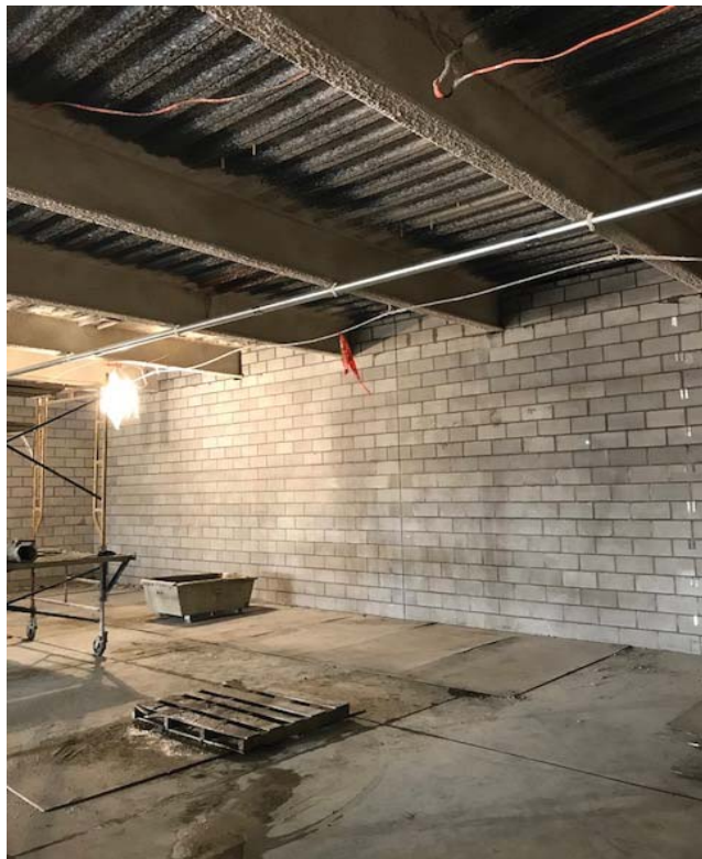
Interior structural CMU walls are put up on the main level of Area A and B