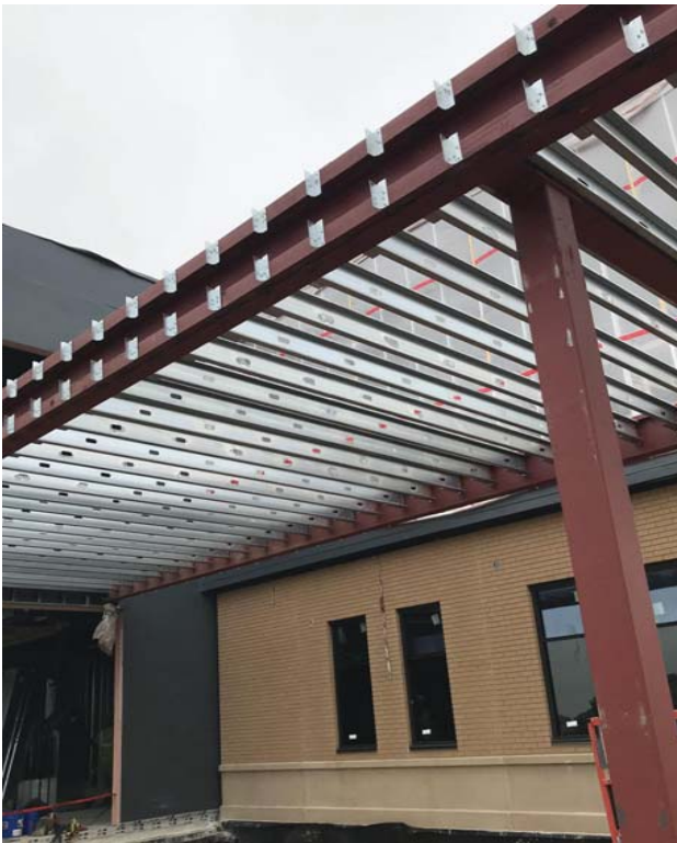
The north entry canopy started to get framed up this week.