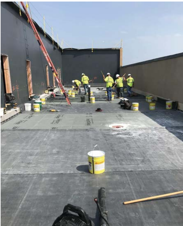
Roofers lay EPDM roofing and insulation on the last part of Area A.