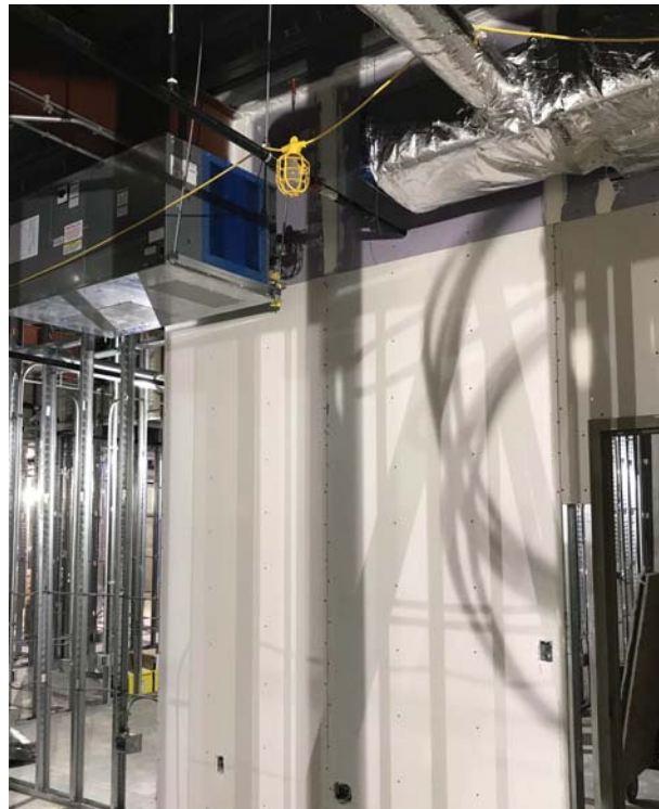
HVAC rough ins progress on all levels of the building. The insulators follow behind them to insulate pipe and vents.