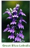
Great Blue Lobelia Lobelia siphilitica