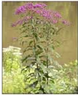
Ironweed Vernonia fasciculata