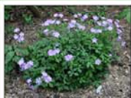
Wild Geranium Geranium maculatum