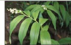
False Solomon's Seal Smilacina stellata