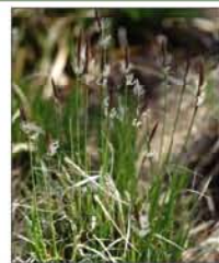
Sun Sedge Carex pennsylvanica