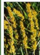
Fox Sedge Carex vulpinoidea