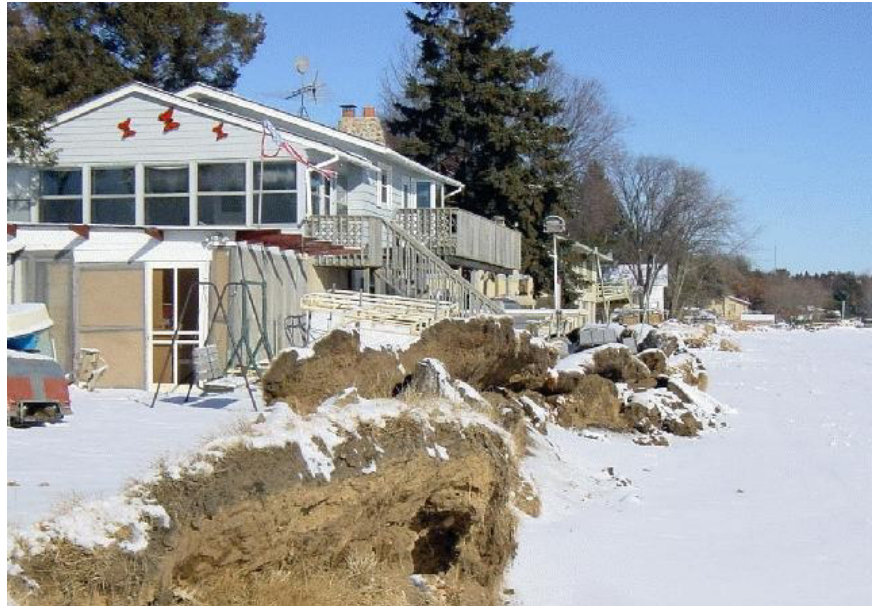
Ice ridge formed along the shore of Shamaineau Lake in Morrison County, February 2003.

Property owners occasionally return to their cabins in the spring only to discover they are dealing with property damage caused by a phenomenon called “ice heaving” or “ice jacking”. This powerful natural force forms a feature along the shoreline known as an “ice ridge”. The result may include significant damage to retaining walls, docks and boat lifts, and sometimes even to the cabin itself.