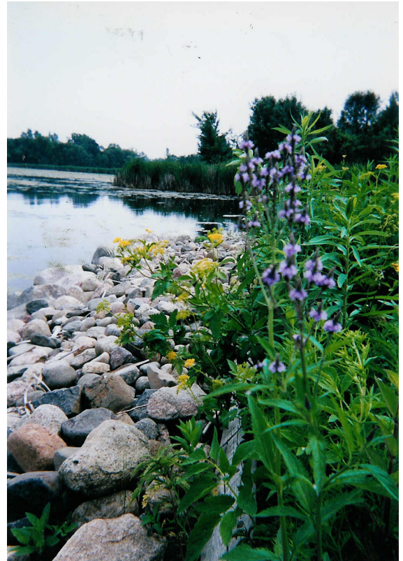
Shoreline stabilized with riprap and enhanced with a vegetative buffer.

If your shoreline is eroding, any of the following events may be destabilizing your soil, resulting in erosion: fluctuating water levels, increased wave or wake action, ice pushes, loss of natural vegetation, and human activity. Protecting your shoreline from erosion may not require you to replace natural shoreline with a high-cost, highly engineered retaining wall or riprap. There are affordable, low-impact methods to stabilize your shoreline and still protect property values, water quality, and habitat. The Minnesota Department of Natural Resources (DNR) encourages you to consider planting native vegetation to control shoreline erosion, enhance aesthetic values, and contribute to better water quality in your lake (see Lakescaping information sheet).